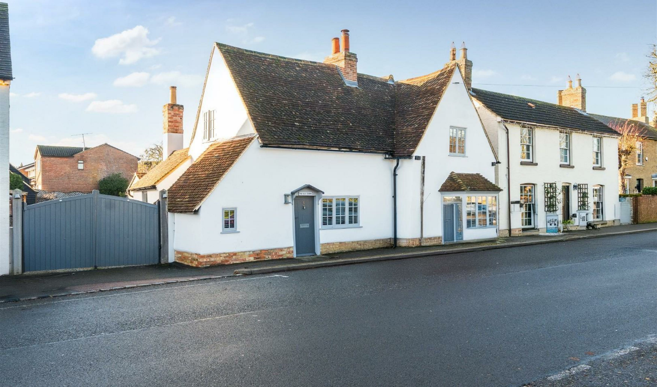
The Old Crown Inn, High Street, Great Barford £1,150,000